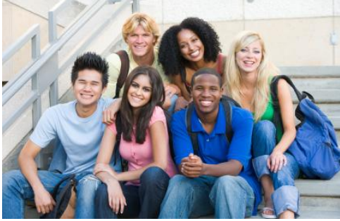
For First Generation, African American, Latino, Asian American, Native American, and Pacific Islander Students and their Families

Saturday, January 31, 2015 – 9:00 am to 1:00 pm